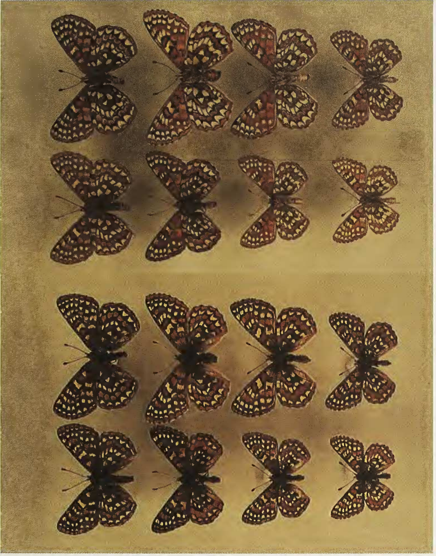
Fig. 2. Euphydryas editha quino and parapatric subspecies. Columns across: ♂ upperside, ♀ upperside, ♂ underside, ♀ underside. Top row: editha , ♂ CA: San Luis Obispo Co., Foothill Rd. near Los Osos, 29.IV.1976, ♀ same. Second row: quino , ♂ CA: San Diego Co., hills S of Lake Jennings, 25.III.1981, ♀ CA: San Diego Co., Dictionary Hill, 23.III.1975. Third row: new species, ♂ CA: San Bernardino Co., near Bowen Ranch SE of Hesperia, 14.IV.1987, ♀ same. Bottom row: augustina , ♂ CA: San Bernardino Co., Cienega Seca Crk., ♀ same. E. e. insularis is illustrated in Emmel & Emmel (1975).